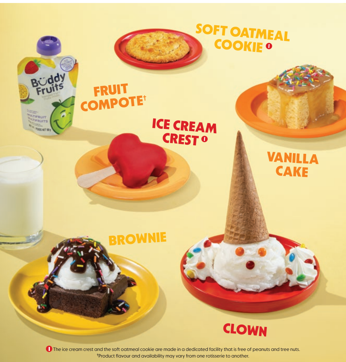
SOFT OATMEAL COOKIE 1