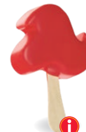
Ice cream crest