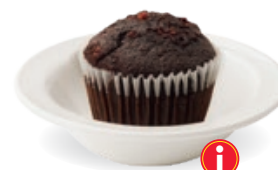
Chocolate and raspberry muffin